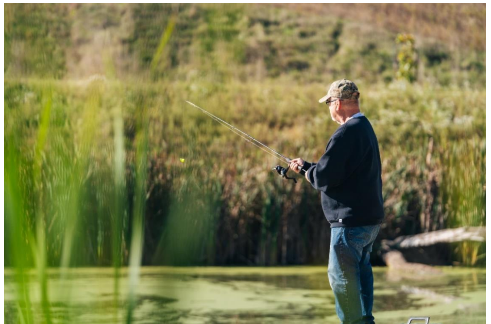
Central Park Lake (top) Jones County used Parks to People funding to dredge the lake and make habitat improvements at Central Park. Prairie Creek Park (bottom) Parks to People funding helped Jackson County develop a recently-donated parcel of land into a new park.