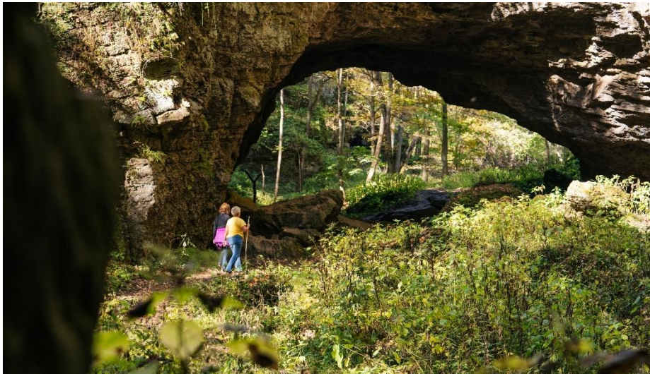
Maquoketa Caves State Park in Jackson County

In addition to addressing its future priorities and implementing specific projects, the region will also continue working on lasting legacy efforts. This includes advocating for sustainable and reliable funding for parks, recreation, and natural and cultural resources. It is especially imperative that those passionate about the vision demand resources to bring our current infrastructure up to standards, and for its continued maintenance. The group will also focus on developing a brand, marketing the region, connecting assets and events to a regional identity and developing coordinated cultural arts programming.