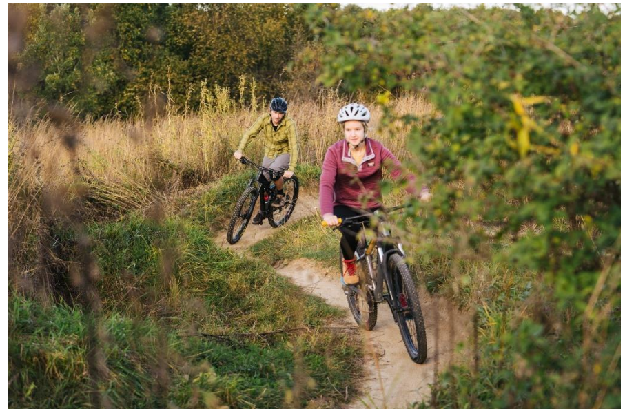
Parks to People funding helped build the Mountain Bike Trails at the Interstate Power Company Forest Preserve in Dubuque County.

With guidance from the Iowa Parks Foundation and RDG Planning and Design, the Leadership Team laid out a process to create a Grant Wood Loop Master Plan (GWLMP) and to establish mechanisms for implementing the plan with the allocated $1.9 million and 5:1 local match. Development of the plan included many partners and stakeholders, and implementation would require many more.